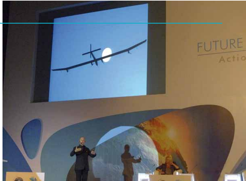
Presentation of the solar aeroplane of Solar Impulse by Bertrand Piccard

From the first days of its independence, Kazakhstan devoted itself to the development of alternative energy sources: