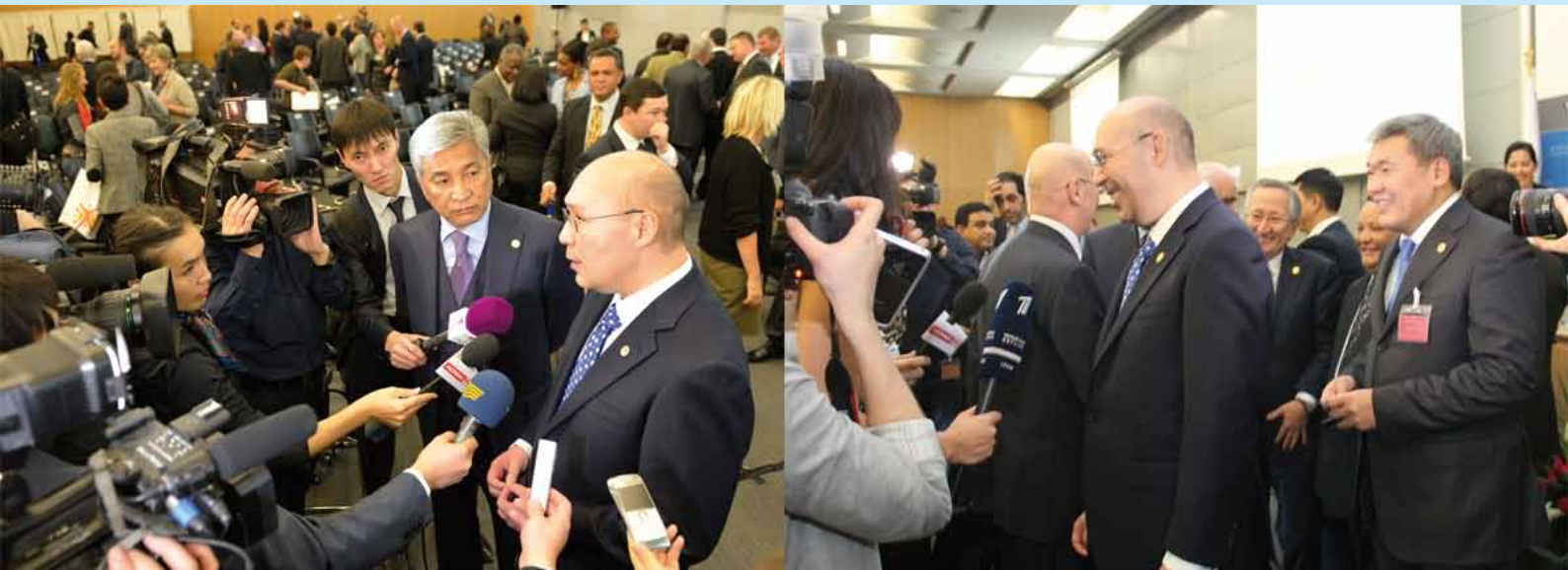
Imangali Tasmagambetov, Mayor of Astana, and Kairat Kelimbetov, Deputy Prime Minister of Kazakhstan.