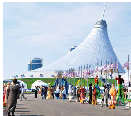
The shopping mall and leisure Centre, Khan Chatyr, is a giant transparent tent.

The site of the city of Astana is very interesting in architectural terms, with an association of the influences of Asia and Europe.