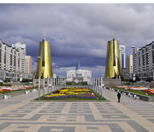
The Presidential Palace.

Administrative capital and economic platform, Astana is in the centre of Kazakhstan, on the right bank of Ichim River. Formerly, it was a small independent village in the middle of steppes, and to-day Astana is considered as the city of the future where all the ideas and all the dreams can become reality.